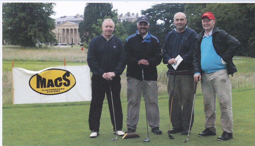
Some participants from last years' Luton Hoo Golf Day.